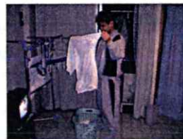
Hanging the washing out to dry