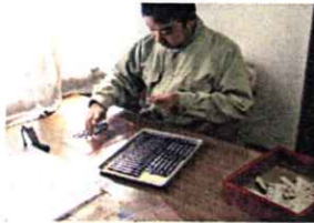
Making miniature trains