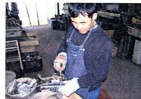
Recycling by disassembling gas pots