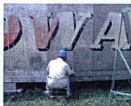
Working at outside company