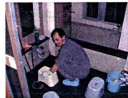
Cleaning the bathroom

Support Center for the People with autism and PDD