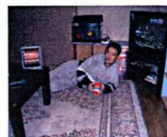
Enjoying free time