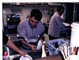
Washing dishes and his own clothes