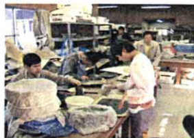
Making original hand made ceramics