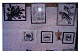
Inhabitant's room decorated with his hand-made embroidery works

KEYAKI-NO-SATO has four group homes. All residents are people with autism. They are all working at YAMABIKO SEISAKUSHO and WORK CENTER KEYAKI. Based on our idea of "Group Independence", persons with severe and mild autism live and work together and we find this leads to great progress for residents in communicating and relating to others. Residents have their own rooms, wash clothes and clean rooms by themselves. Meals are prepared together with the staff. In their free time after supper, they can do as they like---watch TV, listen to music, drink coffee and tea, and read magazines etc. On weekends, most of them go back home to spend time with their families.