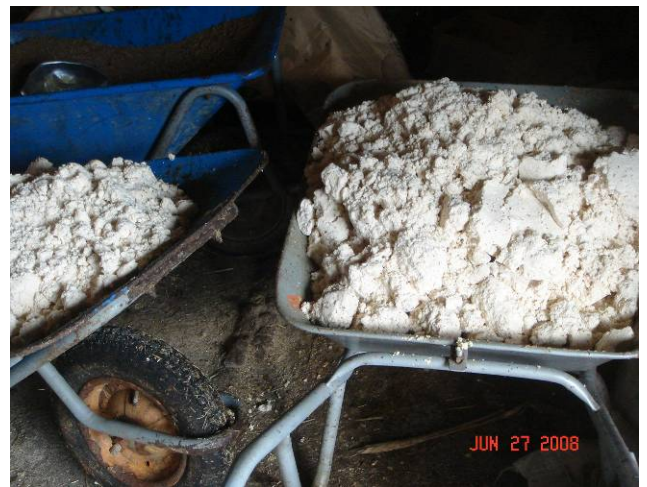
Soy Wastes for Forage