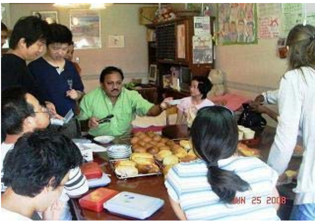
Just baked! yum....